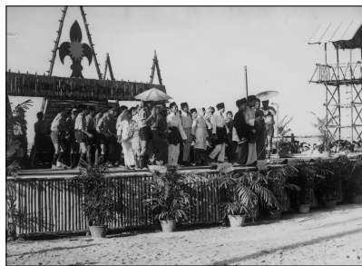
A presentation on the main stage.