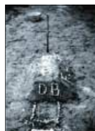
He built this gadget for his exceptionally demanding Troop Leader during The Jamboree before the campground was closed.