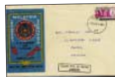
The Post Office issued a first-day cover for The Jamboree