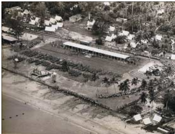
An Air Force helicopter was commissioned to do aerial shots of the opening ceremony of the Jamboree.