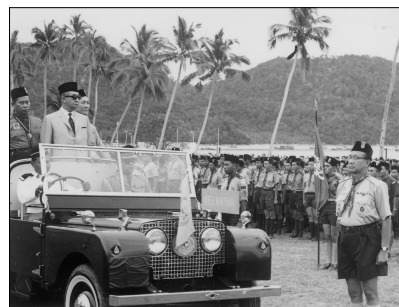
The Yang Di-Pertuan Agung inspecting the assembled participants of the Jamboree.

It is our hope that all the participants to this Jamboree will experience living together and will take away with them very pleasant memories of their stay in Penang. ... I have always stressed the important role that youths constitute approximately 50 percent of our population; it is only fair that a great deal of attention should be devoted to their activities. In this connection, I must make reference to the efforts of the Ministry of Culture, Youth and Sports in promoting useful youth activities throughout the nation.... I would like to thank all the people who have in one way or another contributed to make this Jamboree a success.... our special thanks to the