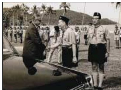
The Prime Minister being received by the Camp Chief upon his arrival.