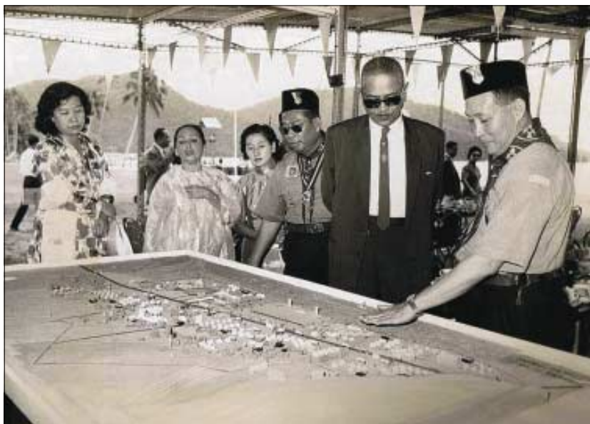
The Tunku being briefed on the design and layout of the Jamboree Campsite by Pow Nee using a scale model of Jubilee Camp as the National Chief Scout of Malaysia, Tan Sri Sardon bin Haji Jubir looks on.

him. He has made extensive preparations, helped by a dedicated band of organizers..... The Scout Promise is one of the factors underlying the happy expansion of the movement at the turn of the Century. For, loyalty to God and to the King and the will to help others at all times indeed make the strongest possible basis for good citizenship and for the help in building a nation.