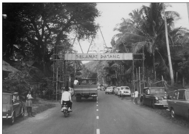
The welcome arch to the Jamboree Village at Teluk Bahang.

Jubilee Camp in Teluk Bahang, the then campsite of the Penang Boy Scouts' Association, was transformed into the Jamboree Village with nearly 3,000 inhabitants of various colours, class and creed, adhering to the Tenets of the Scout Law, which was also adopted as the Law of this Camp.