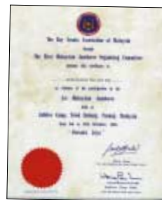
The official participant's certificate.