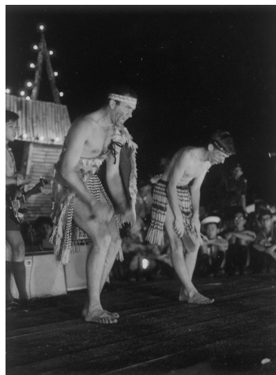
Presentations on the main stage by different national contingents at the Jamboree Campfire