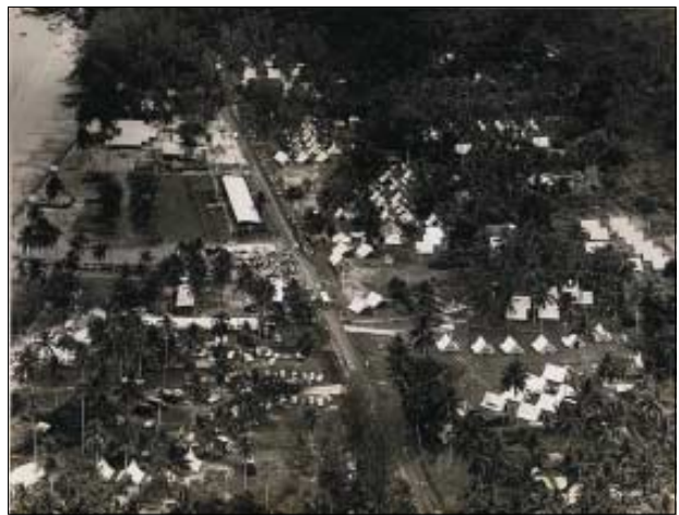
The host contingent from Penang was camped in the area on the far right of this picture on what used to be a chicken farm!