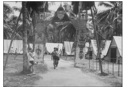
The entrance arch to the tents of the campground assigned to Penang Scouts. It was a chicken farm that had been temporarily cleared for the event.