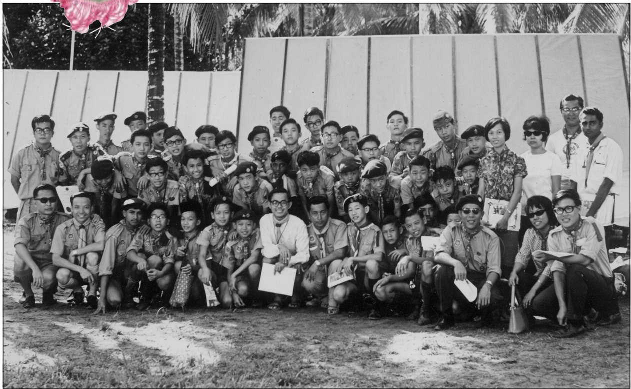
Group photograph of Xaverian Scouts and Scouters who took part in the Jamboree.