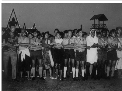
Scouts linking hands to bid farewell.

international relationship. It is hoped that this friendship will continue.