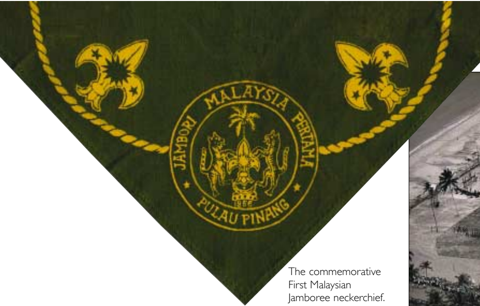
The commemorative First Malaysian Jamboree neckerchief.