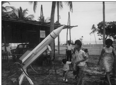
The Jamboree happened during the Apollo Program of sending men to the moon; this model of a rocket captured the fascination of its time with space exploration.