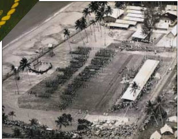
All the contingents in formation for the raising of country flags.