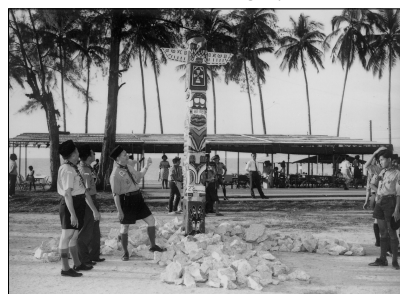
The totem pole was a popular attraction.