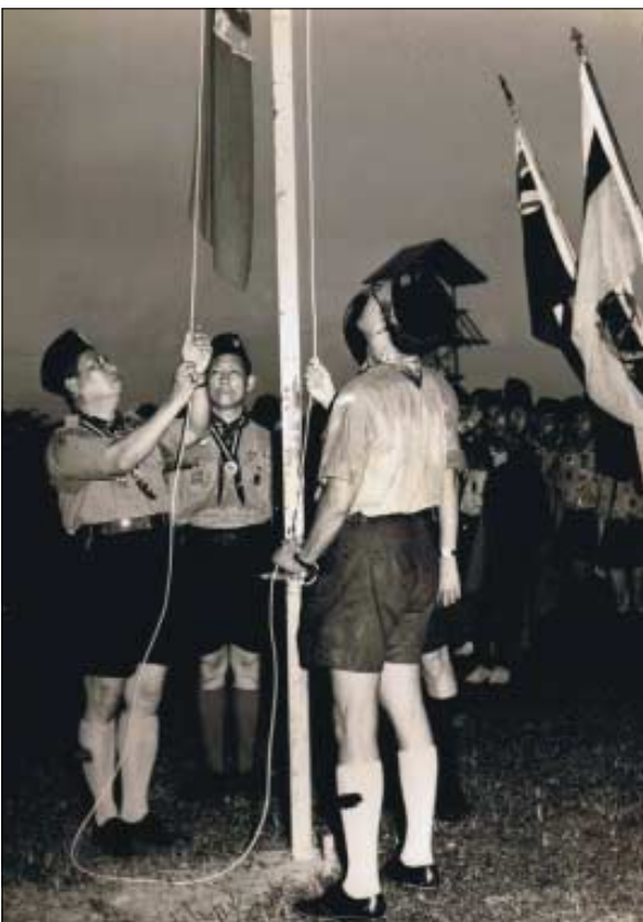
The Chief Scout slowly lowering the Jamboree Flag at the end of the Closing Ceremony.