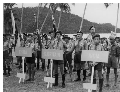
Xaverians from the Penang Contingent were among the Malaysian Scouts selected to carry the name plaques of the different national contingents.