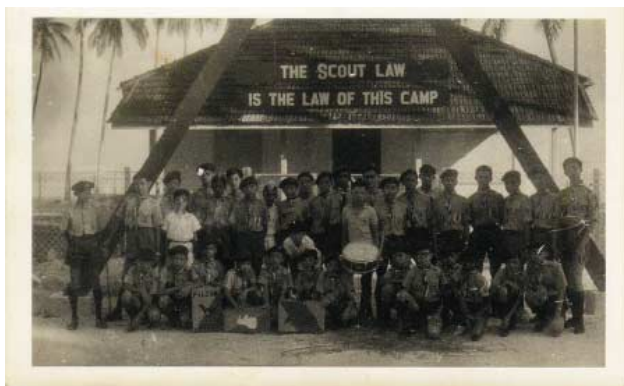
The headquarters building of Jubilee Camp with 7GT(N) Falcon, Rhino and Heron Patrols standing before it for a group photograph after a weekend camp in the mid-1960s.

In 1954, a troop hall and storerooms were constructed at Coronation Camp. The start of construction was officiated by Lord Rowallan, the Chief Scout of The British Commonwealth on 6 November 1954. A big rally was organized at the campsite during which Lord Rowallan was ferried across Waterfall River by Sea Scouts to lay the cornerstone of the new troop hall. Two years later, four bathrooms and four toilets were constructed and added to these campsite facilities.