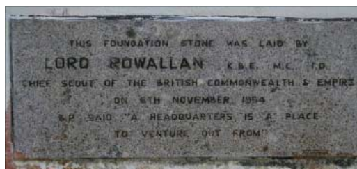
Above: Lord Rowallan, the Chief Scout of The British Commonwealth laying the cornerstone for the Coronation Camp troop hall.