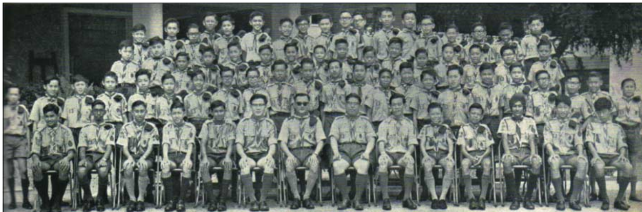
7GT(N) Boy Scout Troop in 1964