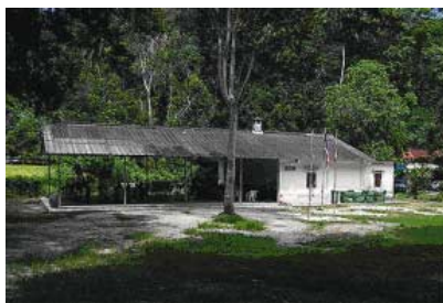
The troop hall and store rooms at Coronation Camp. The tall tree in front of it was climbed by many Scouts as a test for various badges and awards.