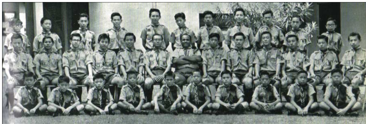
1GT(N) Troop photograph taken in 1963.