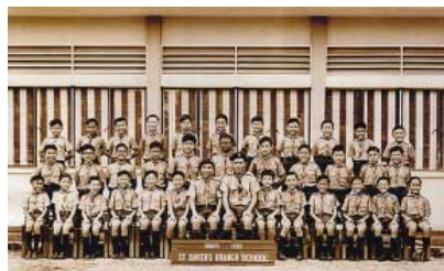
9GT(N) Troop photograph in 1968.

St Xavier's Branch School, affectionately nicknamed "Branch School" by everyone, operated from two locations in Pulau Tikus until the early 1960s. Standards 1 to 3 were based in the old Teoh Mansion (also called Poh Tay House) which still stands on the opposite side of Burmah Road to the Pulau Tikus Convent. The older boys from Standards 4 to 6 studied in the school block built along the Kelawei Road end of the large compound that also housed The Seminary. This block has been torn down and the site build-over as a part of the Paragon shopping mall. It housed St Xavier's Private School in later years, and then DISTED College before the grounds were sold to the developer of the mall and supercondos that now occupy the Seminary's compound. The top floor of the Kelawei block had collapsing doors separating classrooms, when these doors were opened up the whole floor became one big hall that hosted many happy, cheap movie matinees for the boys during the weekends. The "new" school building on Jalan Brother James was completed in the early '60s when all the classes were brought back together under "one roof".