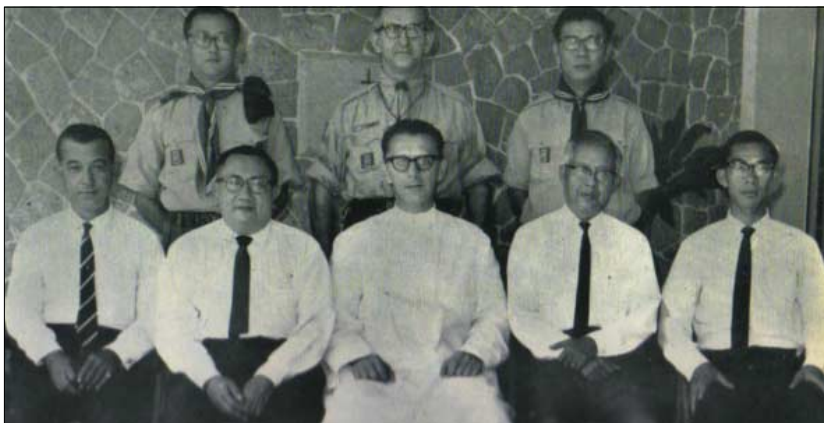
Majlis Perkumpulan Pengakap in 1963