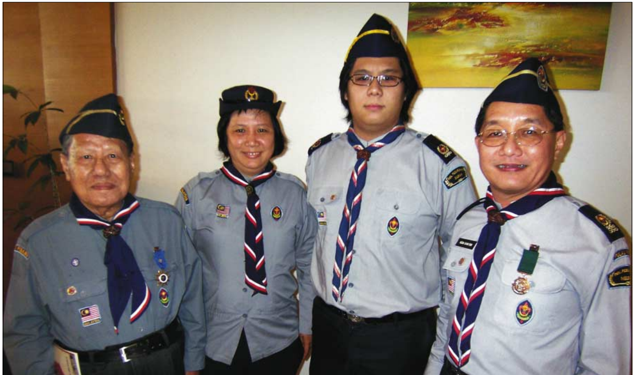
Scouters who led 7GT(N) over the decades.

The office bearers of the Group consists of the Third Formers who run the Boy Scouts Troop, and the Fifth Formers who take charge of the Venture Scout Troop and also assist in the running the Boy Scout Troop. The Sixth Formers run the Rover Section and also help oversee the running of the Scout Group as a whole. A number of Scouts of the Group and have completed their schooling have returned to serve the Group as Scoutmasters and Assistant Scoutmasters.