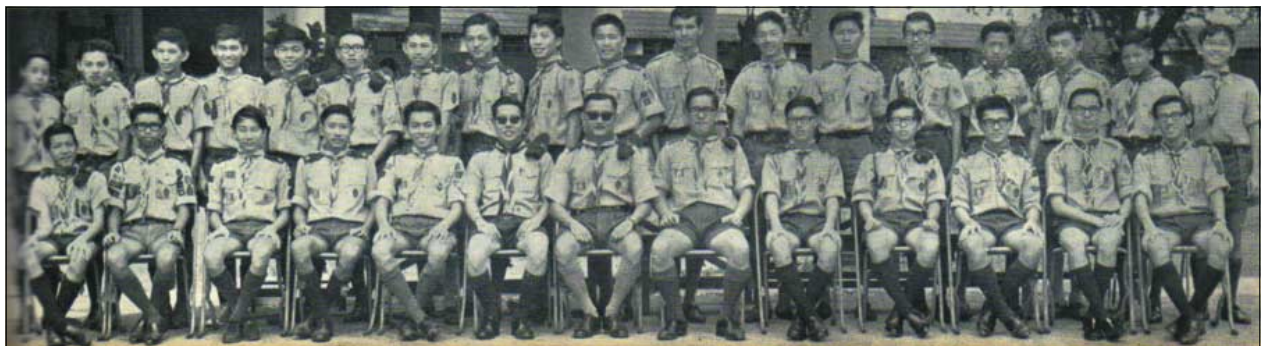
7GT(N) Senior Scout Troop in 1964