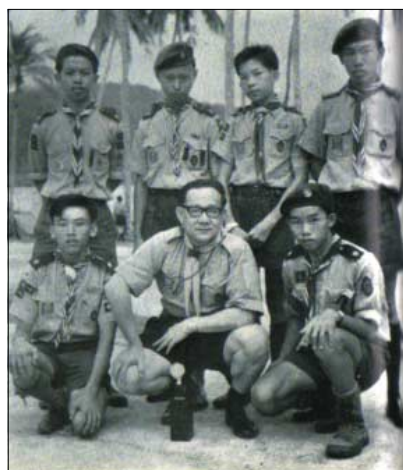
Drake Patrol, the Runner-Up at the CBS Camp.