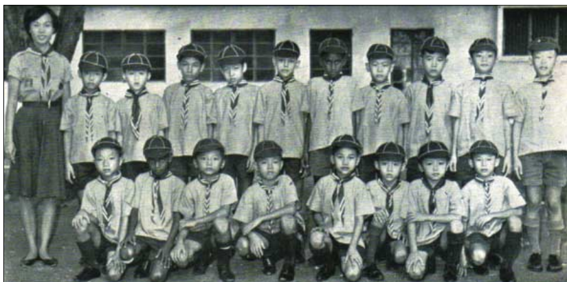
1GT(N) Cub Pack in 1964.