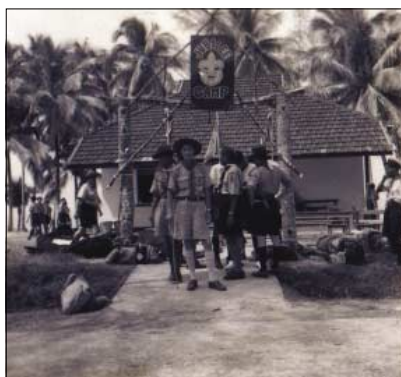
A gathering at Jubilee Camp on 4 December 1953