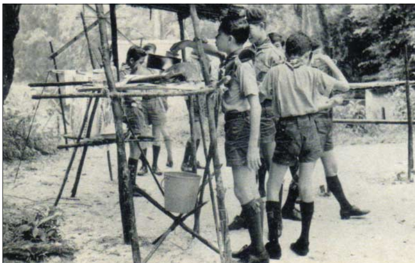
Boy Scouts helping themselves to breakfast at a training camp held at Coronation Camp.

For many members of 7GT(N) the Troop was their home away from home. Many of the boys would head directly to the Troop noticeboard during recess to check for the latest notices pinned up by their Patrol and Troop Leaders about meetings and planned activities. This was also the place to hang-out with their friends. Many lifelong friendships were forged there.