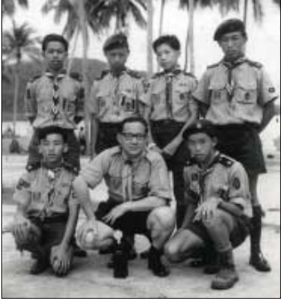
Far left:The Overall Champion of the 2nd CBS Camp was Heron Patrol from 7GT(N) who won the Bro Visitor's Challenge Shield. This was a big enough honour to justify this special Patrol photograph taken in a professional studio. Left: Drake Patrol from IGT(N) were Seniors Champion at the same Camp.