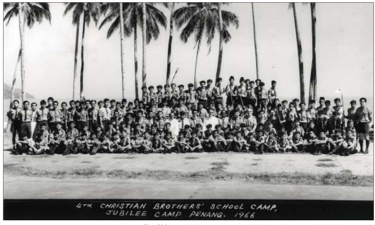
The CBS camps had become very popular in a short time as evident in this group photograph of the fourth CBS camp held from 18–21 April 1966.

Heng San had for a while devoted much effort to raising funds to send one Scout at a time to a national Jamboree held aborad. The fundraising was becoming harder to accomplish; at the same time a camporee involving a large number of Scouts seemed just as